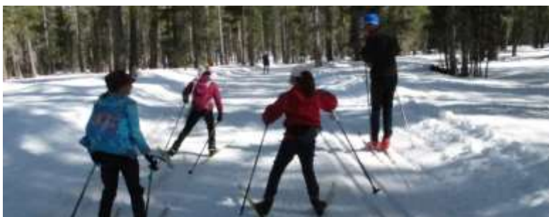
Enjoying x-country skiing