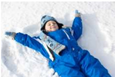
Creating snow angels

Parkrun! It's a free timed 5km run, set up every Saturday at 9:00 from the Edgemont parking lot at Nose hill Park. You will never be last in this run as there is a tail runner every week. Please see http://www.parkrun.ca/nosehill/ for more information.