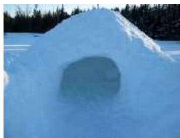
Building a quinzee shelter