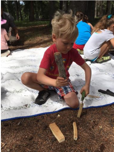
A young camper enjoying Kaykima Wilderness Camp